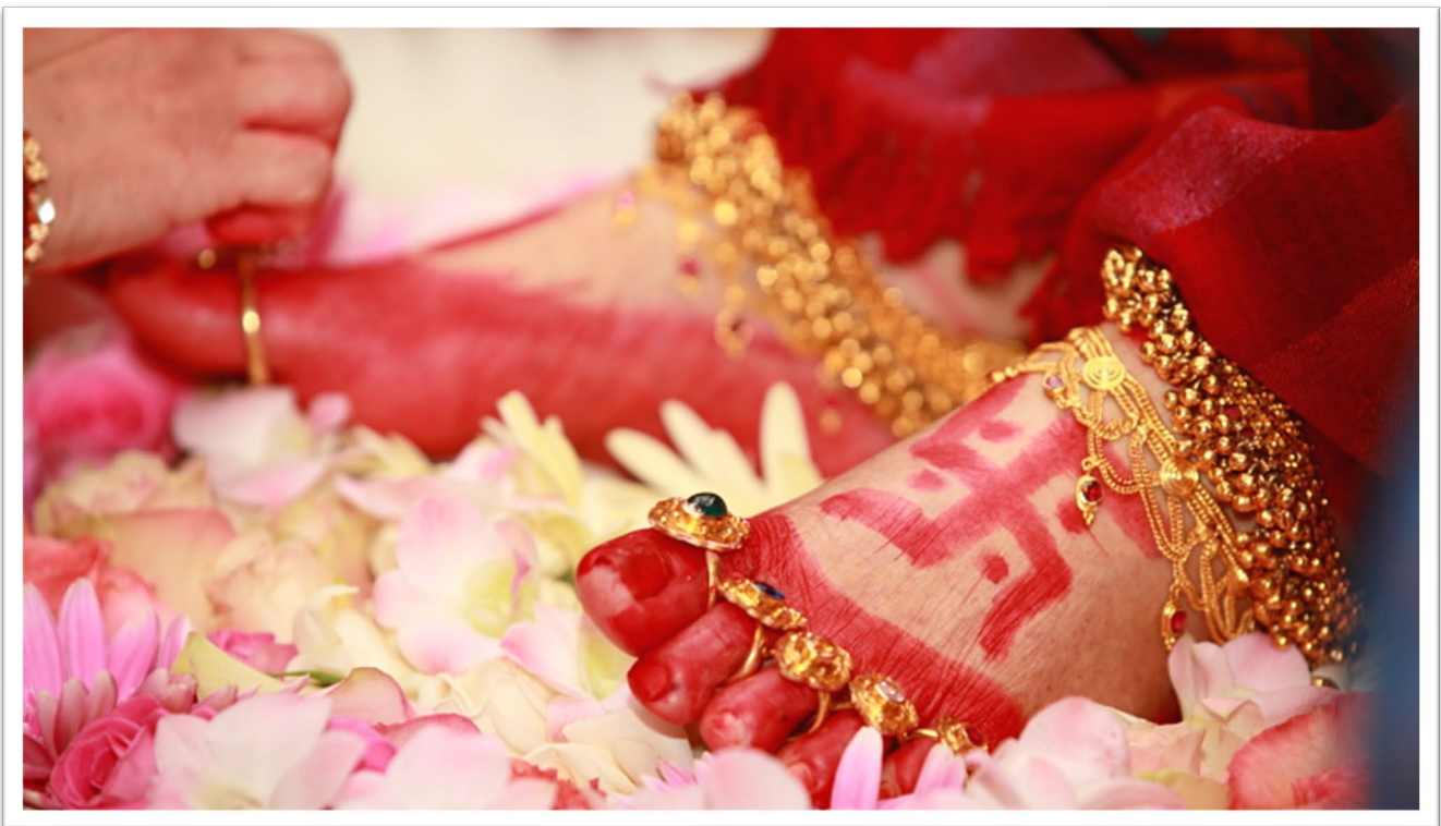
HH Shri Mataji Nirmala Devi Diwali Puja Cabella 18th October 2009

“The last one is the best, where they have the meeting of Shri Rama and his brother Bharat. Shri Rama went to jail, obeying his father; for 14 years he was not in jail, but he went in the forest. It was a kind of a jail only because he was living in the palaces and then he was sent to the forest by his father: with his daughter-in-law, means his own wife, and also the brother - they went together into great sufferings - and you know the whole story of Ramayana. The child that lived in the palaces had to go in the forest and live in terrible conditions, when he was to be the king - it was too much. But Sita (Shri Rama’s wife) went with him and she supported him and ultimately it so happened that Ravana (the demon) came and took away Sita. Shri Rama fought Ravana, killed him, and brought back his wife. But when they came back to their own capital, in Ayodyha, there was a big jubilation and Bharat, his brother, he was very much attached to his brother (Shri Rama) and he ruled that country with the paduka, they say, (a kind of sandalwood slippers they use) of his brother: he put them on the throne, and ruled.