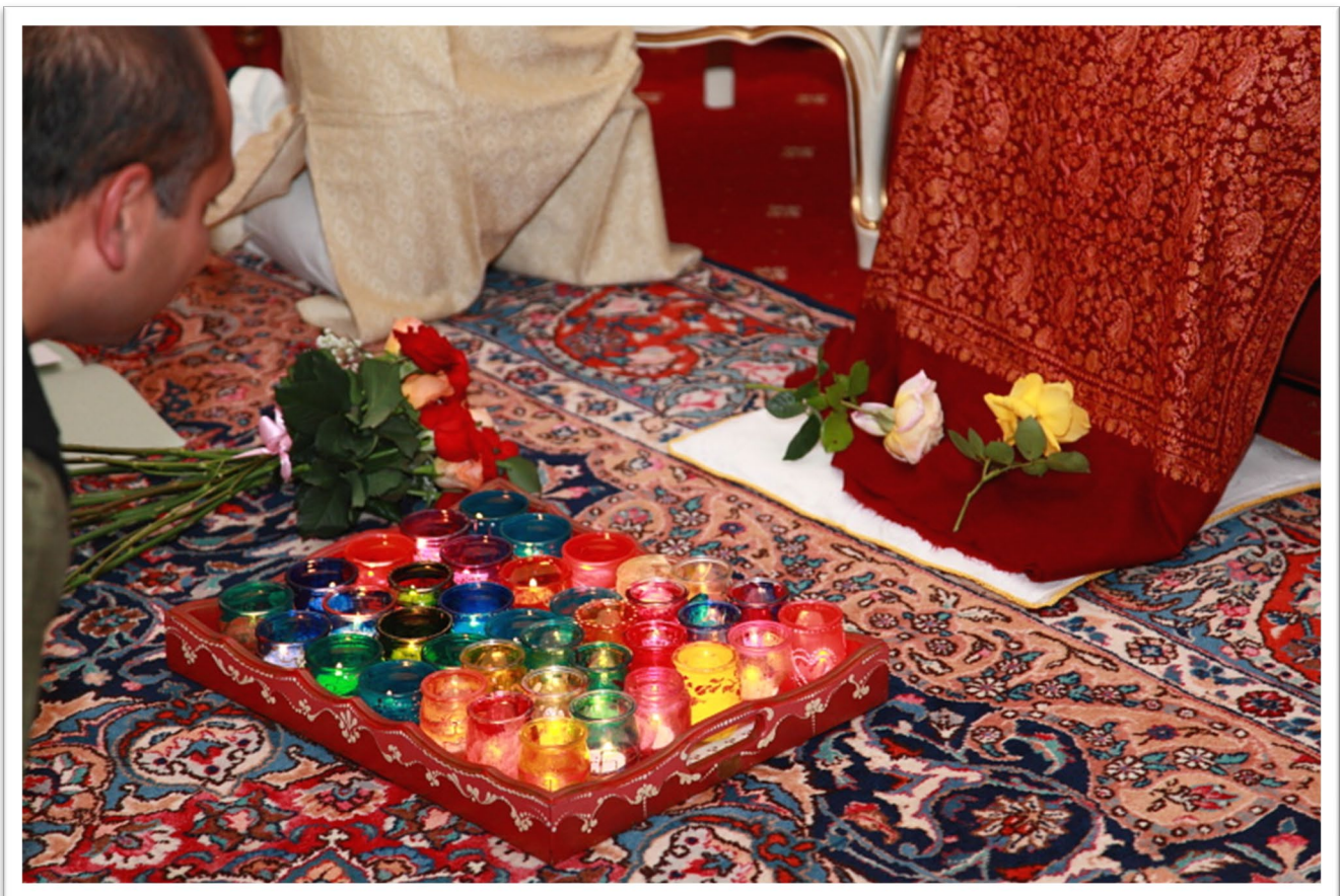
HH Shri Mataji Nirmala Devi Diwali Puja Cabella 18th October 2009