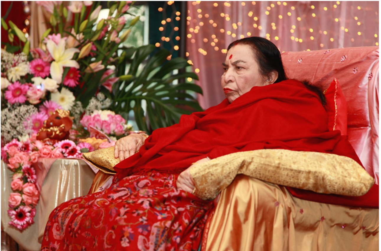
HH Shri Mataji Nirmala Devi Diwali Puja Cabella 18th October 2009

for our money, whatever it is, but what are you doing for others? That you should see for yourself, and that's very important. Only such people are useful in Sahaja Yoga because they have concern, they have care, and they are doing something for others. It's a great enjoyment with that, when the lights are burning, it's to give you happiness; they are burning their bodies to give you happiness. They are the ones who should teach us that we have to do something ourselves to enjoy our own higher awareness. ...Now as it is, what is the aim after all, what is the aim of our lives? We have to change the whole world into a peaceful theme. Changing yourself, of course, is great thing, no doubt; but changing others also will stop all the problems of the world. If all the people of this world become good people, then can you imagine what will happen?"