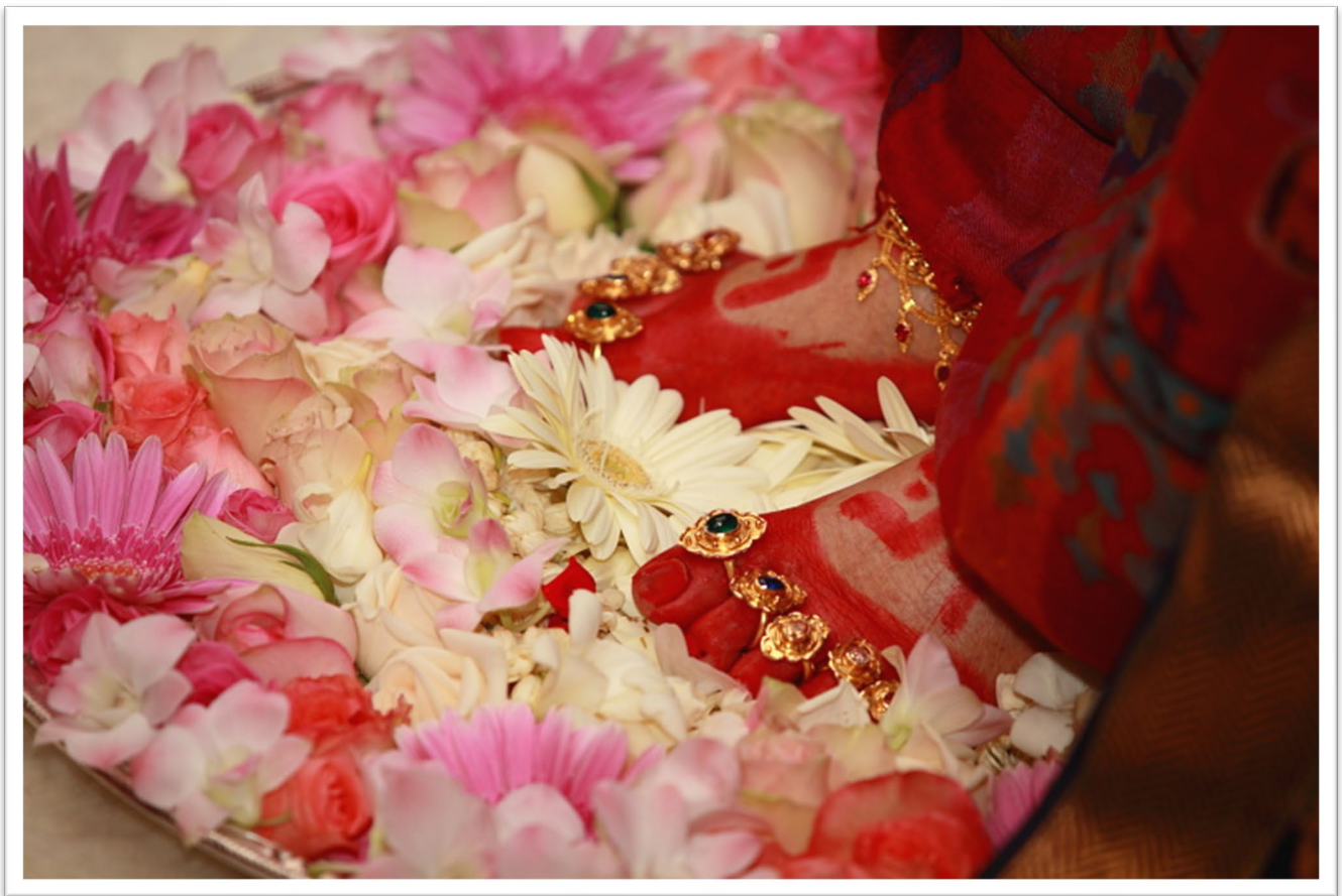
HH Shri Mataji Nirjala Devi Diwali Puja Cabella 18th October 2009

“So, what is that? What is this Lakshmi? See symbolically, what is it expressing? It is expressing the Awareness. Lakshmi expresses awareness, and she came out of the sea, you know that; the awareness first started growing in the sea. The life started existing in the sea, to begin with, and then it grew out. Without the life there is no awareness. First the life, because everything is jarda, everything is dead, and when it becomes life it means it has awareness. So, the Awareness started growing in the Sea. This is the symbolic expression. In the gross level you can understand this way. So for me it is symbolic to see how the life came into being in the sea and that it became aware.”