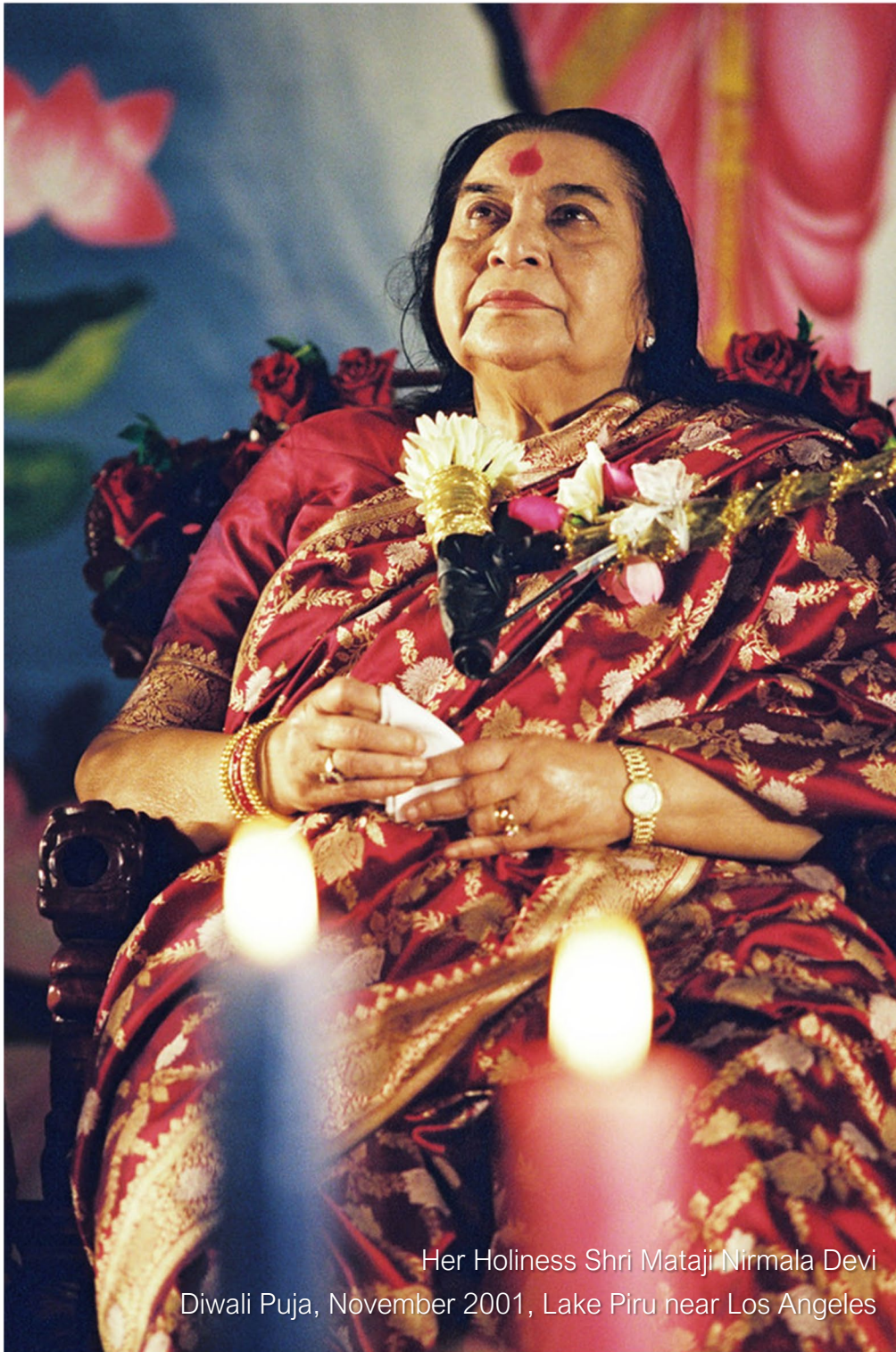
Her Holiness Shri Mataji Nirmala Devi Diwali Puja, November 2001, Lake Piru near Los Angeles