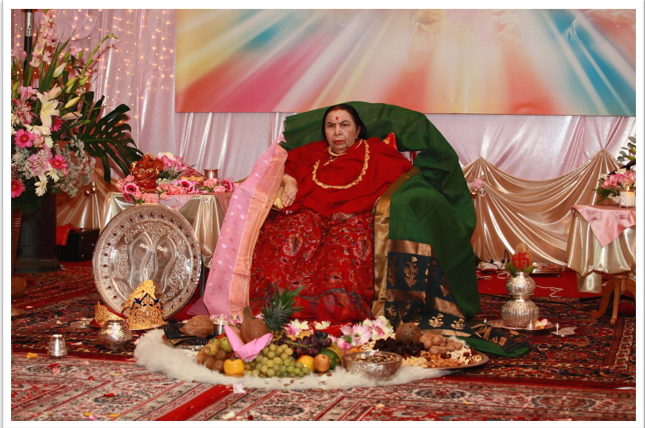
HH Shri Mataji Nirmala Devi Diwali Puja Cabella 18th October 2009

Specific to Sahaja Yoga, is the integration that it brings between various faiths, mythologies and religions; the thread that is binding them all in such a beautiful and natural way becomes visible and can be even experienced by those that speak and understand the language of the vibratory awareness.