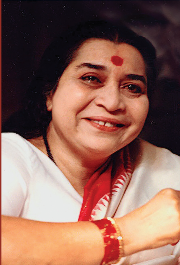
Her Holiness Shri Mataji - Tears of Joy