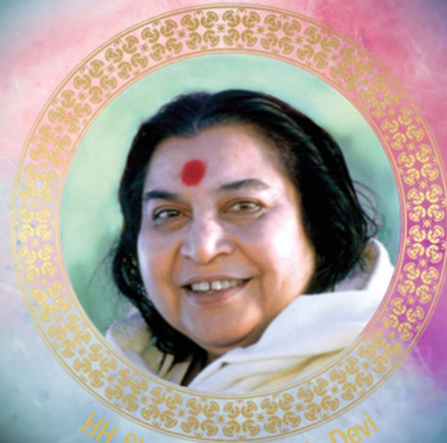
HH Shri Mataji Nirmala Devi

CONTACT THE WEBTEAM AT INFO@SAHAJAYOGA.COM.AU